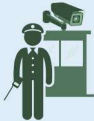
Security Cabin & CCTV Surveillance