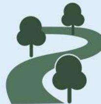
2 Landscaped Parks